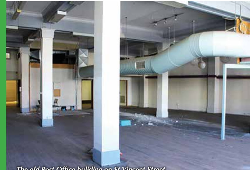
The old Post Office buliding on St Vincent Street

Expressions of interest for the Post Office have now closed.