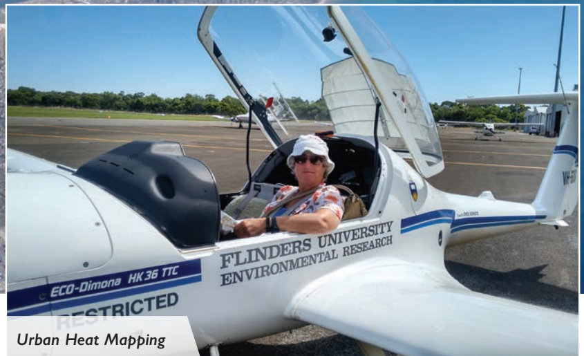
Urban Heat Mapping